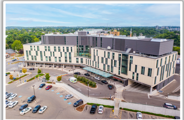
New Hospital Wing-Includes Birthing

Our practice is located conveniently across the street from Cambridge Memorial Hospital where we can order oxytocin and epidurals on our authority. We have excellent relationships with our consultants. CMH is a level 2 hospital with a new and beautiful Labour and Delivery space. Midwives are provided with in-depth hospital orientation to adjust to the community. GRs coming from partial scope communities will have additional training to ease transitioning into full scope. Our catchment area covers Cambridge, North Dumfries, and the surrounding area. We have a satellite clinic located in Ayr, Ontario.