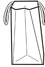
Paper storage bag with handles